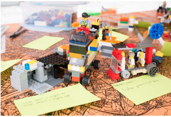
Fig. 2. London energy mapped and modeled at Utopia Fair. Photo: Gorm Ashurst 2016.

covered the tabletop, and labelled with a sticky note. As the game progressed through numerous iterations the map became populated with a growing number of proposed solutions to London's energy challenges.