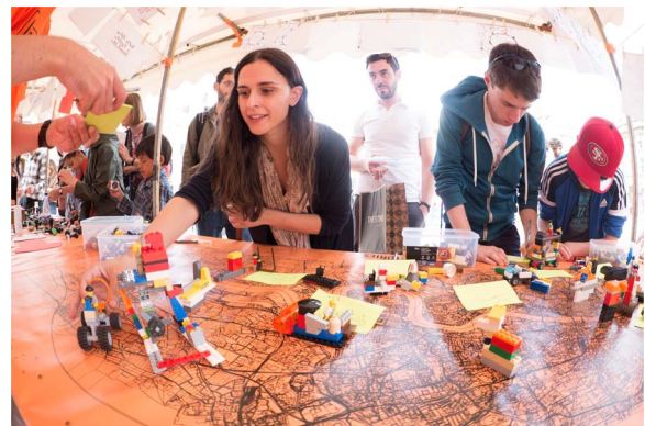
Fig. 1. Model London at Utopia Fair: building a future energy utopia with Lego and sticky notes.

In a second phase of the game, the opposing teams then collaborated to build the proposal (or an object representing the proposal) out of Lego, Plasticine and other building materials (Fig. 2). This object was placed in an appropriate location on a large-scale map of London that