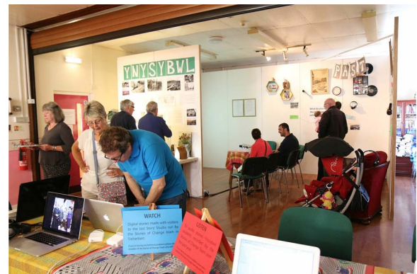
Fig. 6. The Story Studio, Ynysybwl.

phase of the Everyday Lives work. These valleys have been physically, economically and culturally shaped by coal extraction, and more recently have been the site of some of the biggest wind turbine arrays in the UK. After consultation with community partners, we chose the local community centre as the Studio's location, taking it over for the duration and transforming it into an interactive space designed to present our research and to invite people's responses to it. We created a setting for people to listen to short versions of oral history interviews that the team had conducted in the village in the summer of 2015, one year previously, which had specifically addressed the topic of energy (Fig. 5). Visitors could pick up wireless headphones playing the stories on a loop and listen to as much or as little as they liked. We also provided laptops and invited visitors to watch digital stories we had created with participants in separate research activity in another valleys village, Treherbert, in the previous summer.