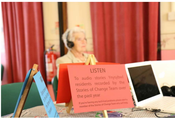
Fig. 5. Listening to digital stories, Ynysybwl. Photo: Lisa Heledd Jones, 2016.