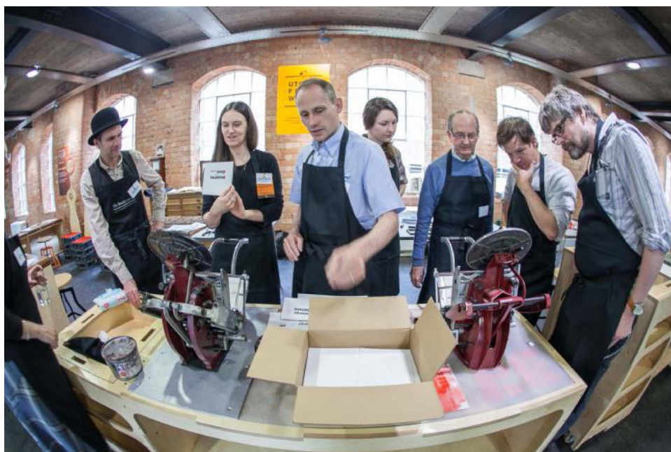
Fig. 4. Printing pamphlets on the letterpress, Utopia Works, Derby Silk Mill.

In May 2016, in collaboration with creative and local partners, members of the south Wales based Everyday Lives strand of the Stories project organised a three-day event, the Creative Energy Festival , in the village of Ynysybwl in south Wales. Its main focus was a two-day Story Studio where we invited local residents to engage with the work we had done in the region up until that point, including Ynysybwl itself, exploring the past, present and future of energy in the South Wales valleys. The Studio followed a format that had been deployed in an earlier