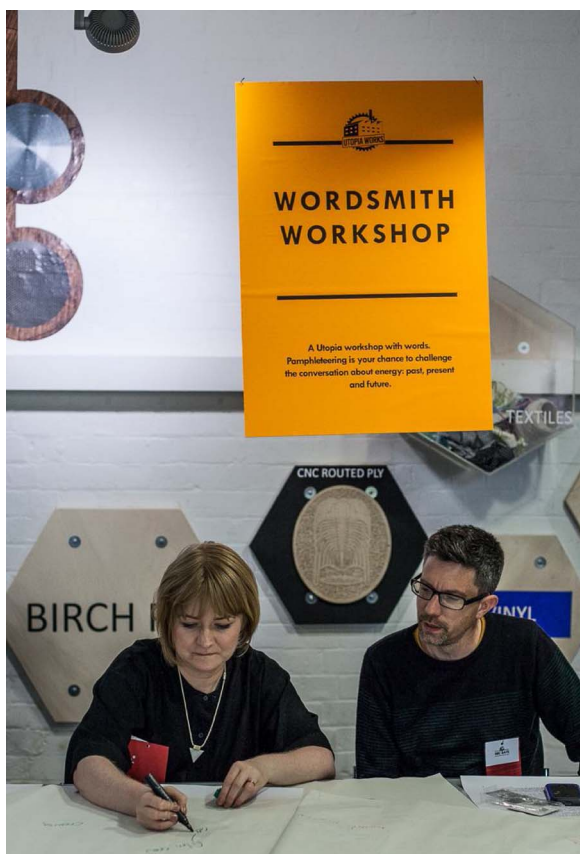
Fig. 3. Drafting pamphlets, Utopia Works, Derby Silk Mill.

hierarchical authority. Everyone was a team player and brought their unique knowledge, experience and limits to the table; we just worked together genially toward the team goal' [67]. A literature PhD student described the conclusion to the event in another blog post: