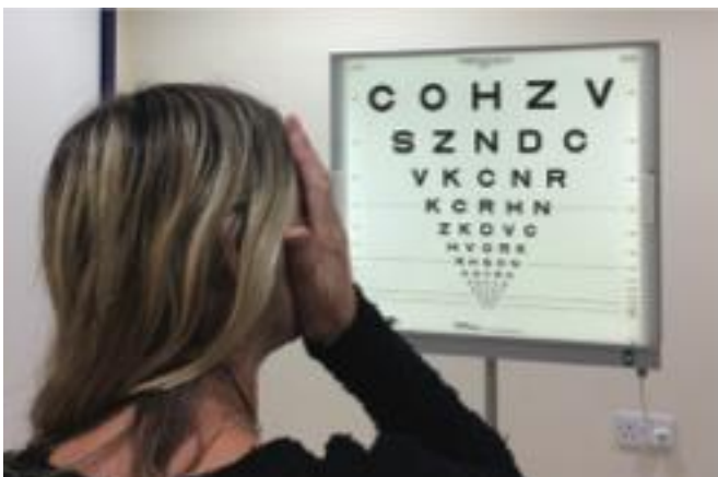
Figure 2. The Early Treatment Diabetic Retinopathy Study (ETDRS) charts use Sloan optotypes silk-screened on a non-reflective translucent panel in a 5 × 5 grid pattern. Charts are slotted into a light box containing two fluorescent lamps. Charts are now available in Landolt C, tumbling E and Patti Pics symbols and for use at baseline working distances of 4m, 3m and 2m.

Physical print sizes include the familiar N-point notation or Sloan M units. The M unit designates the distance (in metres) at which the object subtends 5' arc. Bailey and Lovie-Kitchin (1980) measured 1M to be equivalent to N8, although it has been found that the physical print size of the 1M print size incorporated into the MNREAD charts is slightly larger than N10 (Latham and Tabrett 2012).