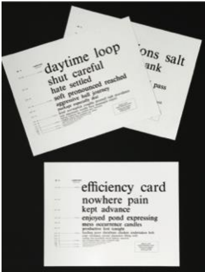
Figure 4. The Bailey-Lovie word reading charts. The charts present a wide range of physical print sizes from N80 to N2 (Sloan 10M to 0.25M) and in a logarithmic progression from 1.6 to 0.0 logMAR when held at 25cm. The charts are available in Times New Roman font, chosen for its widespread use in most newspapers and books.

As with a distance logMAR chart, MNREAD charts can be used at shorter working distances to extend the range of angular acuity that may be assessed (Legge 2011). Changes to the appropriate near correction may be required from the +2.50D addition used at 40cm.