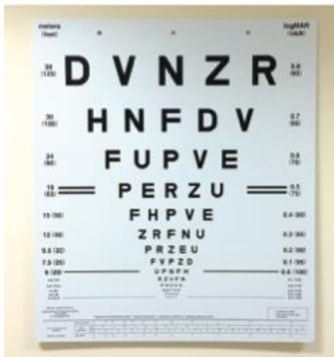
Figure 1. Bailey–Lovie charts are 53 × 61cm with British standard optotypes presented in a logMAR progression. The minimum angle of resolution (MAR) is taken as the stroke width of the letter, which is one-fifth of the letter's vertical subtense when printed in a 5 × 4 presentation. Recommended luminance for acuity testing is 160cd/m 2 .

The first logMAR acuity charts were developed by Bailey and Lovie in 1976 and went into production in 1978 (Bailey and Lovie-Kitchin 1976). The standard working distance is 6m, and they are externally illuminated with a tolerable luminance range of 80–320cd/m 2 , within which visual acuity testing may be performed (Sheedy et al. 1984). The design principles of the Bailey–Lovie chart have been used to produce a range of similar charts using a wide range of symbols.