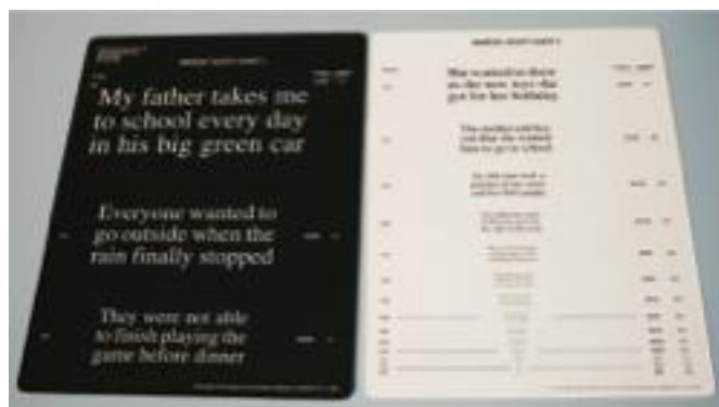
Figure 5. The Minnesota low-vision reading test (MNREAD) charts show continuous text print from N64 to N1 (8M to 0.13M), reducing in 0.1 log steps from 1.3 to -0.5 logMAR when used at the recommended working distance of 40cm. Charts are also available in reverse contrast. The passages are aimed at individuals who have a reading age of 8 and over. Recommended chart luminance is a minimum of 80cd/m 2 .

The Minnesota low-vision reading test (Ahn et al. 1995; Mansfield and Legge 2007) is a continuous text reading chart, using short single sentences printed on to three lines with the level of difficulty standardised by using the same number of characters in each sentence.