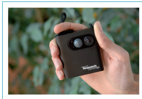
Figure 1. The Sensecam.

The Sensecam is a small, light (93 g) camera and is worn on a lanyard around the neck, resting on the user's chest. The Sensecam comprises a camera (640 × 480 pixels) with a fish-eye lens to provide a horizontal 130-degree field of view. 32 The Sensecam automatically captures at least one image every 30 seconds (Figures 2 and 3).